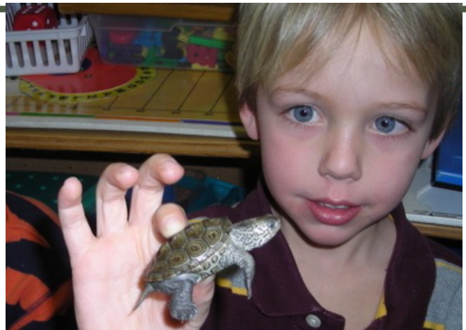
Poplar Island visits EES kindergarten.

Sign Up Now: Call Mary E. Reeser at 410-822-4410. The boat only holds only 24 people. So we will honor the first 24 people and then keep a waiting list. You may take one guest. Further details will be provided at the March Luncheon.