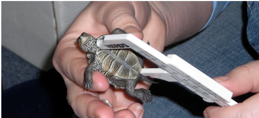
A kindergarten student measures a baby turtle from Poplar Island.

For those who would like to car pool, please let me know if you can drive or just need a ride. We will meet at the Easton Volunteer Fire Co. parking lot at 7:45 a.m. Many of us will be staying for lunch at the Harrison’s House. We will have tables reserved, but you will be ordering from the menu and having separate checks. Let me know if you will be joining us for lunch. Call me if you have any questions. It should be a great trip!